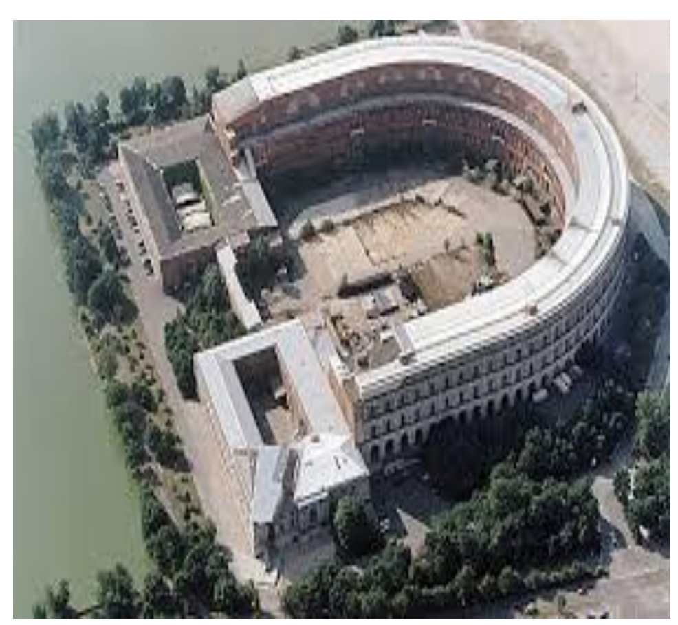
Documentation Center – Nazi Party